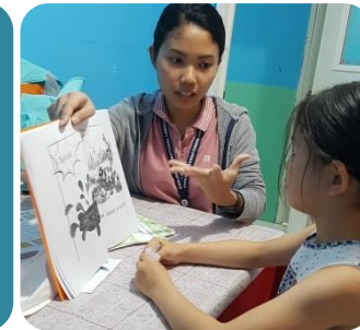
Man to Man