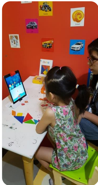
UW Class (OSMO)